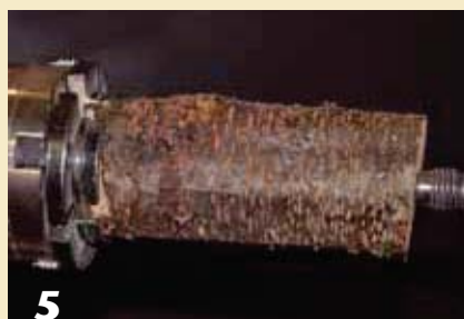
5 Mount a length of freshly cut wood into a four-jaw chuck. Turn it into a cylinder.

I normally start with 120 grit and then finish with 180, 240, or 320 ▶