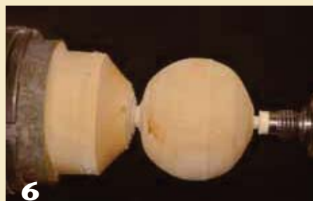
6 Turn the ball into a rough shape, then part it off the lathe.