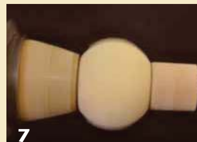
7 With the lathe's speed set at about 1,000 rpm and the ball held in between the cup centers, the revolving out-of-round form creates a ghost around its outer edge. Turn away this ghost.