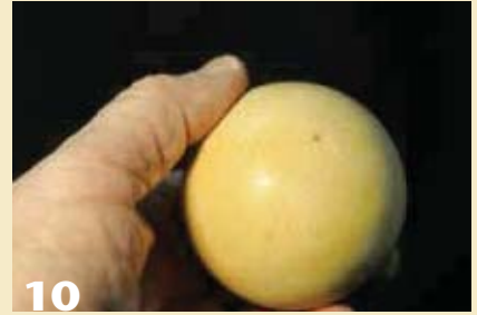
10 A sphere turned, sanded, and buffed in about ten minutes.

grit, depending on the wood and my needs. Generally, stopping at 240 grit is enough to achieve a smooth finish on most woods. When using Abranet, don't press hard—light pressure will do a much better job and won't produce heat that can warp the wood.