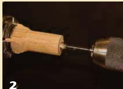
2 Drill a hole in the tailstock cup center. Use a Forstner bit, mounted in a Jacobs chuck.