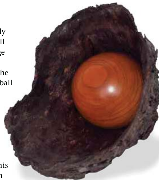
Safe at Home was created from a piece of bark that covered a bump on a log. The sphere is black cherry, 2¼" (6 cm)

Minor imperfections can be removed by hand sanding with the lathe running. Recently, following David Ellsworth's advice, I started using Mirka-brand Abranet ( www.mirka.com/abranet ).