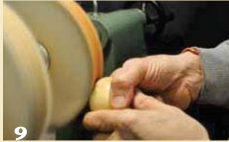
9 When buffing the sphere, hold it tight against the wheel and support it against the direction of rotation.