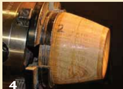
4 Mark the position of the jaws on the headstock cup center so that it can be placed back into the chuck in exactly the same position as when it was made.

To make the tailstock-end cup center, begin with a piece of solid hardwood that is about 3" × 1½" (8 cm × 4 cm). Mark the center on one end and insert the other end into a four-jaw chuck. Bring up the revolving tailstock center and tighten its center point into the center of the wood so that the wood is held securely. Turn a cylinder that is about 1½" (4 cm) in diameter.