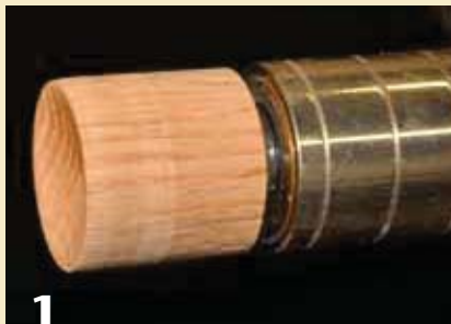
1 The tailstock cup center will ultimately be attached to the live center in the tailstock.