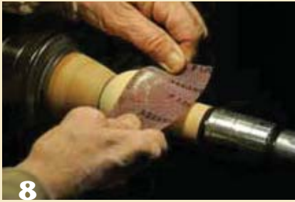
8 Sand the sphere. An Abranet abrasive is used here. Note that the sawdust flows through the mesh of the fabric.