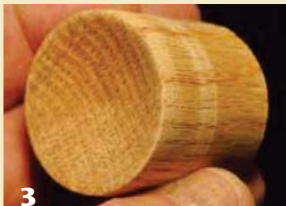
3 The tailstock-end cup center is ready for use. Not shown is the hole drilled in the other end.